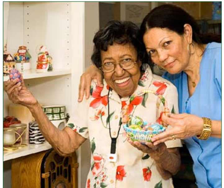
The Elderly Ministries Program of Community Ministries, Rockville, provides homemaker aide services, case management, assistive devices and weekly telephone reassurance calls to low income seniors and disabled adults.